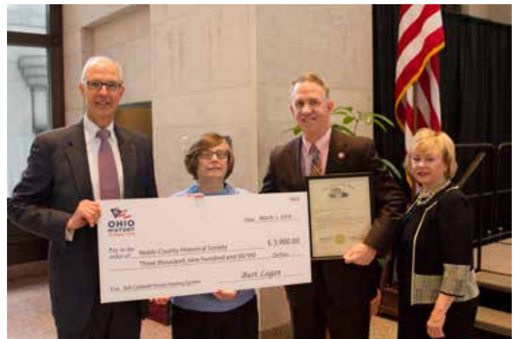
The Noble County Historical Society receives its History Fund grant at Statehood Day 2015.