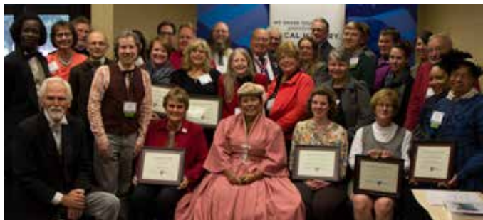
2015 OLHA Awards winners at the Annual Meeting last October.

The Ohio Local History Alliance is now accepting nominations for its 2016 Outstanding Achievement Awards! The Alliance presents awards in two categories – Individual Achievement and History Outreach. Individual Achievement Awards recognize those who have made outstanding contributions to Ohio’s historical societies, history museums, or the understanding and appreciation of state and local history. History Outreach Awards recognize outstanding local history projects in the categories of public programming, media and publications, and exhibits/displays. Nomination forms and supporting materials must be postmarked no later than August 1, 2016. Download the complete guidelines and a nomination form.