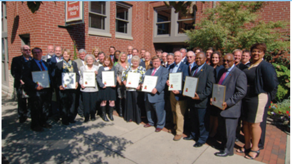
The 2013 Ohio Historic Preservation Office award recipients.

Village Commission —recognition of the 50th anniversary of establishment of the German Village Commission