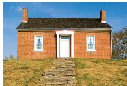
The Rankin House, Ripley.

The Ohio Historical Society is currently in the process of restoring the interior of the 1829 Rankin House in Ripley, Ohio and has found evidence that at least two of the first floor rooms originally had decorative stenciling applied to the walls. Unfortunately, the evidence of what the full design was is sparse and creating a design for an entire room could quickly cross over into conjecture. The hope is to locate extant examples of stenciling in the vicinity or along the same migration route as the Rankin House (the Ohio River and Zane's Trace). Ideally, OHS will find a house stenciled by the same artist or "school" of artists, with stenciling layouts that use the same couple of patterns at the Rankin House. Any information or leads you might have would be greatly appreciated! For more information, including pictures of what was found at the Rankin House, or to share any information you have, please contact Chris Buchanan, Restoration Project Coordinator, at cbuchanan@ohiohistory.org or 419-496-7243.