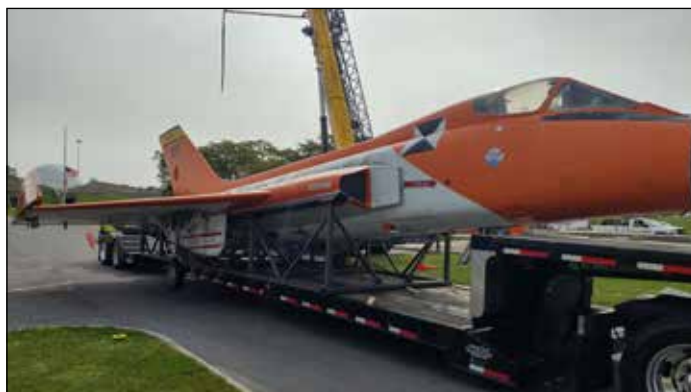
After being placed on the flatbed trailer, the Skylancer is almost ready for its journey to Copley, OH.

restoration. Thomarios removed almost all of the old paint on the Skylancer and cleaned the interior. Several paint layers appeared that spanned the history of the aircraft. With this discovery, restorers will be able to match the original colors used while Armstrong flew the Skylancer. The airplane will return to its designation as "NASA 213" with dark orange and white paint, potentially indicative of its use as an experimental aircraft. NASA designated the plane to be "NASA 802" towards the end of its career, particularly during its participation in the Lifting Bodies program.