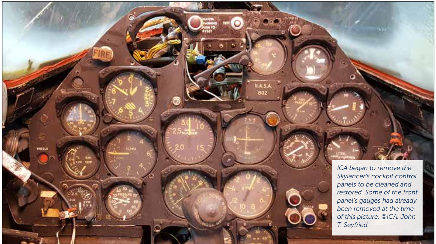
ICA began to remove the Skylancer's cockpit control panels to be cleaned and restored. Some of the front panel's gauges had already been removed at the time of this picture.