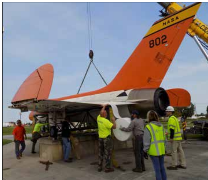
The moving team, including Thomarios and ICA, slid ethafoam between the frame and the Skylancer's wing to provide padding for the wings and prevent any possible abrasions from the support frame.

BuNo 142350 looks very different six months into the