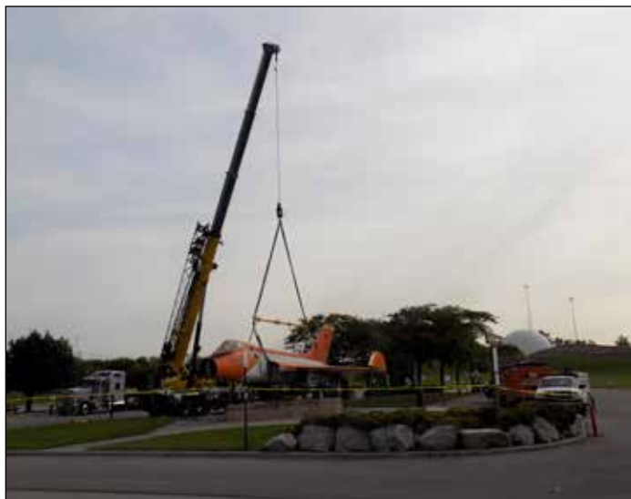
BuNo 142350 was lifted onto a flatbed trailer by a crane on the morning of September 11, 2017.