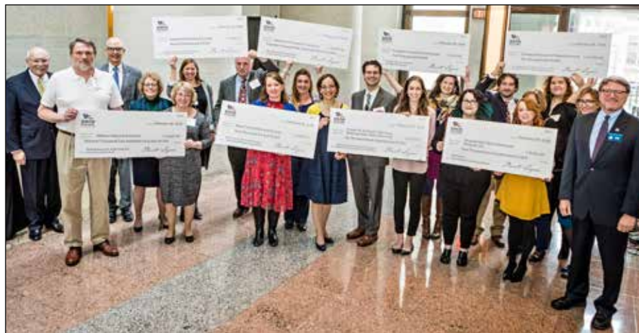
This year's Ohio History Fund grant recipients. At Statehood Day 2018 on February 28, the Ohio History Connection announced nine new grant recipients and awards totaling $76,000

$13,240 for "Rehabilitating the Mabel Hartzell Historical Home Roof," which will replace the deteriorated asphalt shingle roof of the house with a historically accurate standing seam metal roof. Second floor ceilings and artifacts have been damaged by leaks in the c. 1867 house and the roof can no longer be repaired. The new, period-appropriate roof will protect the structure and the society's collections therein. Once the new roof is installed, the society will proceed with other repairs to the house and the conservation of artifacts damaged when the old roof leaked. The house is listed on the National Register of Historic Places and the Secretary of the Interior's Standards for Rehabilitation will guide the work.