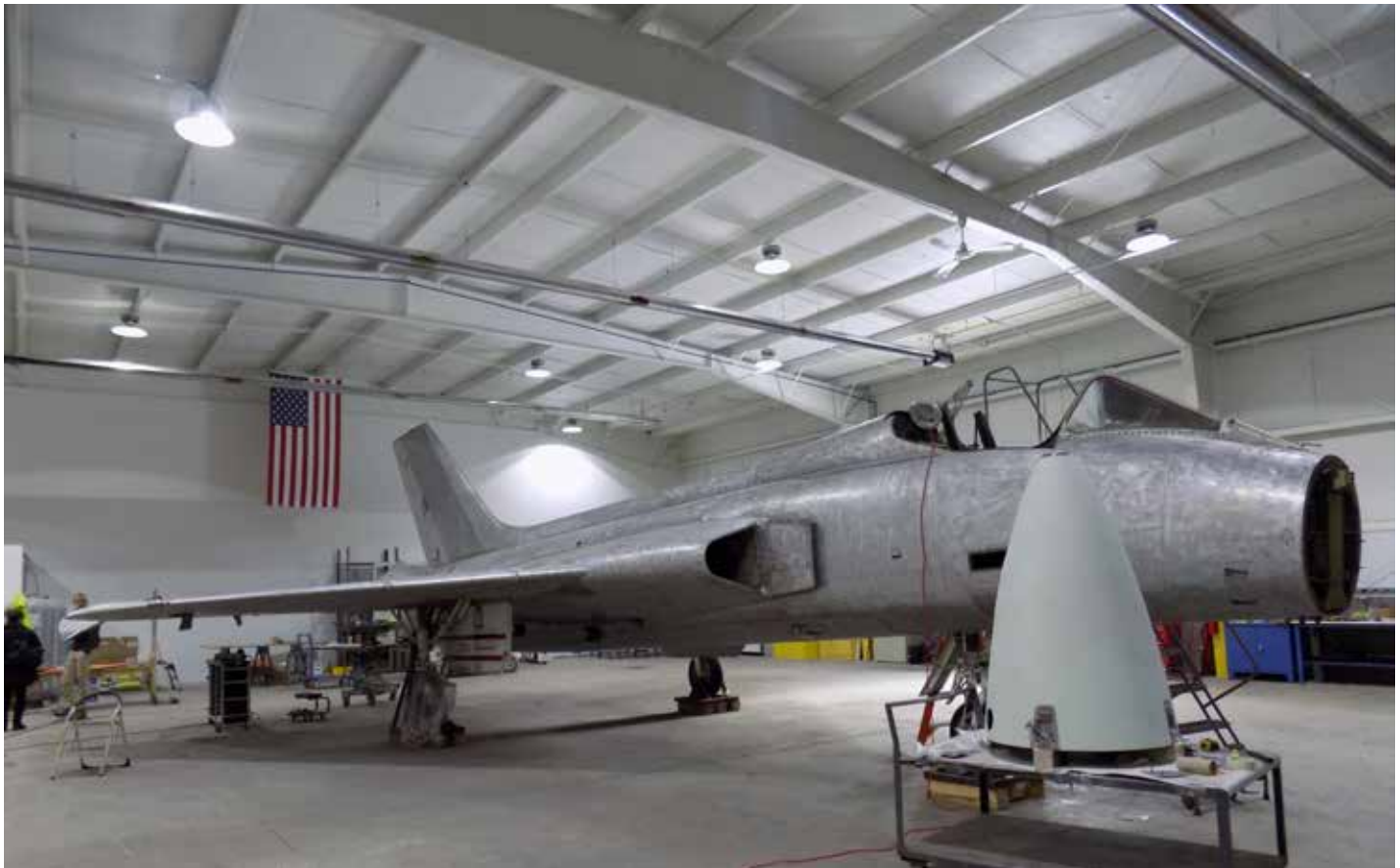
By the beginning of February, Thomarios removed almost all paint from BuNo 142350. The radome has been covered with fiberglass cloth.

ICA has removed the seat and many gauges and controls of the Skylancer's cockpit for restoration in their lab. Their team is stabilizing some of the fragile materials, such as the seat's fabric, and cleaning the components. The cockpit's components will remain outside the airplane and be displayed inside the Armstrong Air & Space Museum in 2019. Visitors will be able to see controls that Neil Armstrong and other pilots used during the abort launch procedure.