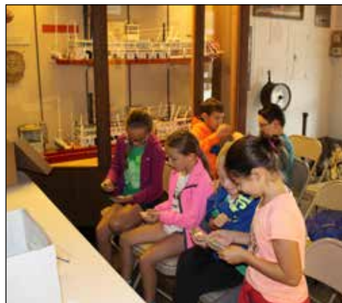
These fourth-graders are learning about mussels and the human impacts on them at the the Ohio River Museum.

After classes visit, at the end of each month, the museum calls each school for an invoice from the school(s) to be submitted for reimbursement for bus transportation costs. The donations are deposited in a special earmarked account for the program. We pay school bus grants from that account. Stewardship is very important – we have a volunteer who sends out thank you's to donors.