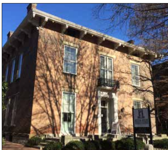
Far left: A visitor to Kelton House using an audio tour unit purchased with a History Fund grant. Usage of the units has doubled this year, compared to fall 2016. Left: The Kelton House Museum & Garden.