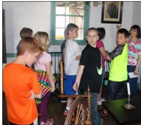
Local fourth-grade students tour the Rufus Putnam House at Campus Martius Museum.

I write letters to individuals, businesses, and organizations who are potential funders to solicit funds. We don't ask for specific donation amounts. We are grateful for any amount we receive.