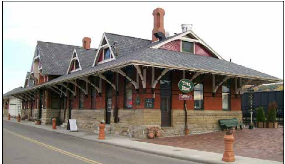
The Dennison Railroad Depot Museum and Uhrichsville Clay Museum.

We also hope these stories inspire you to give. As The Local Historian will proclaim during tax season, 100% of the money for History Fund grants is voluntarily given. It comes from donations of state income tax refunds, the sales of Ohio History "mastodon" license plates, and direct contributions to the Ohio History Connection for the History Fund. The more the History Fund receives in donations, the more it grants back to organizations like yours – maybe yours, if you apply!