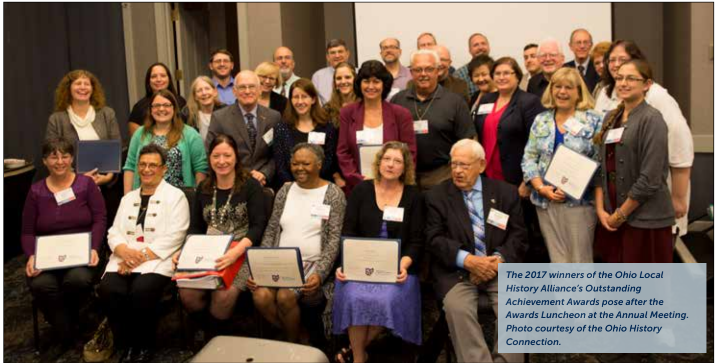
The 2017 winners of the Ohio Local History Alliance's Outstanding Achievement Awards pose after the Awards Luncheon at the Annual Meeting.