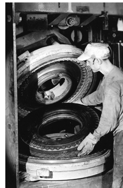
Cover Image: Employee making tires at the Goodyear Tire and Rubber Company factory in Akron, Ohio, ca. 1950. Goodyear was founded in Akron by Frank Seiberling in 1898.

Contact OLHA Annual Meeting and Conference, c/o Local History Office, Ohio History Connection, 800 East 17th Ave, Columbus, Ohio 43211-2497, 1-800-576-0381, localhistory@ohiohistory.org