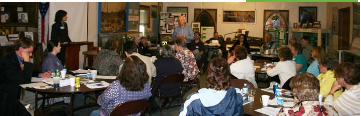
Lunch time at each regional meeting is also Sharing Time. One person from each organization represented at the meeting gets two minutes to talk about what that organization has accomplished in the past year and what they are planning for next year.