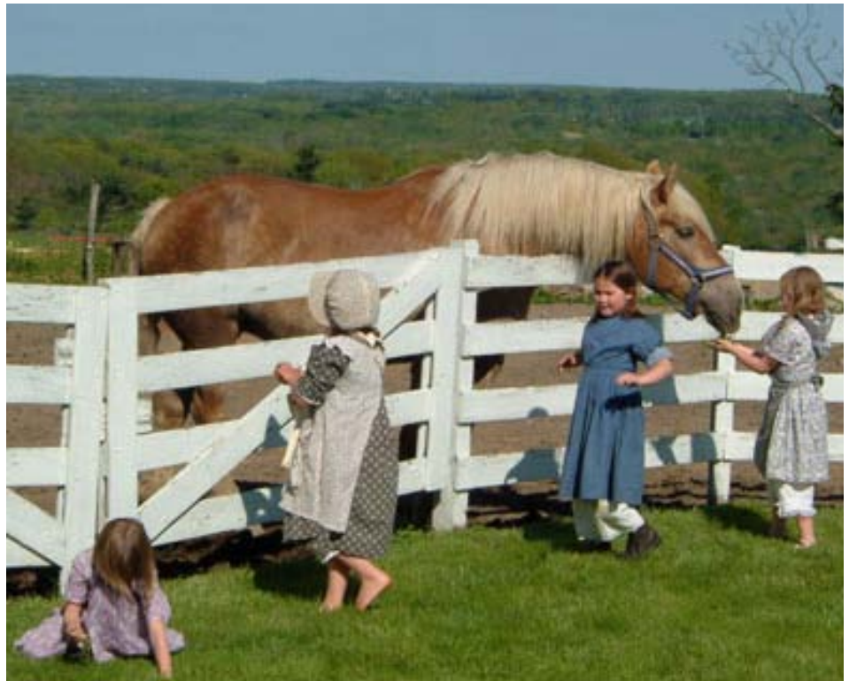
Region 4 attendees enjoyed the view while on the tour of the Geauga County Historical Society's Century Village Museum (but the children missed the meeting!).

(combined regional meeting) Belmont County Historical Society, Barnesville