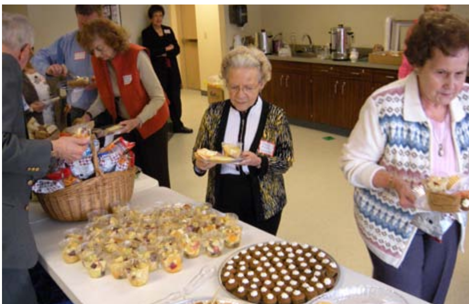
Lunch at the Region 9 & 10 meeting featured pumpkin deserts (representing the Barnesville Pumpkin Festival) and strawberries. From the 1880s until WWI, Barnesville was known as the Strawberry Capital of the Midwest. During berry season, the city shipped several thousand bushels daily to cities like Pittsburgh, Philadelphia, Chicago, Washington D.C., and Cincinnati.