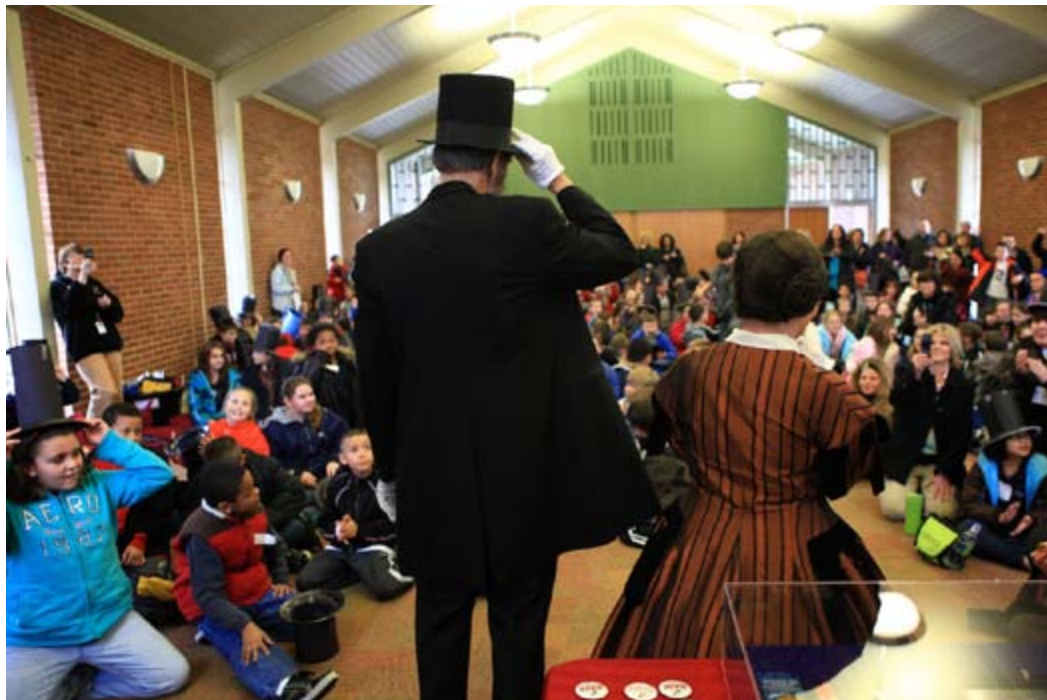
Abraham and Mary Lincoln speak to Wilmington fourth graders at the Quaker Heritage Center's Lincoln Day in February.

Wilmington's curriculum director made the decision that all classes and schools in the district would participate, and disseminated our flyer to the schools. She connected us with a teacher looking for experience in curriculum development to hone our educational booklet and ob-